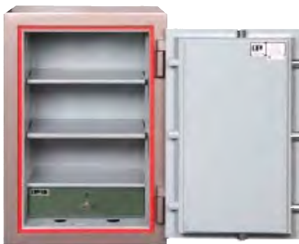
MODEL COMMERCE 3

Commerce Safes comply with IATA Travel industry specifications.